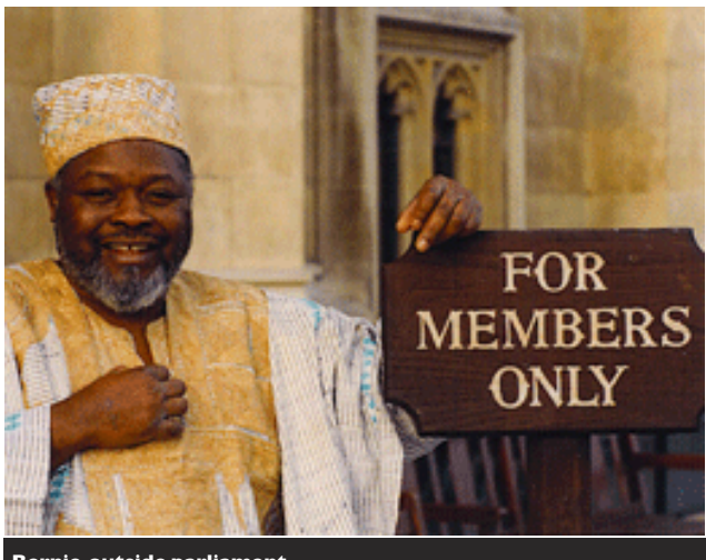
Bernie outside parliament

Making links between what happened in north London, in the rest of Britain and across the